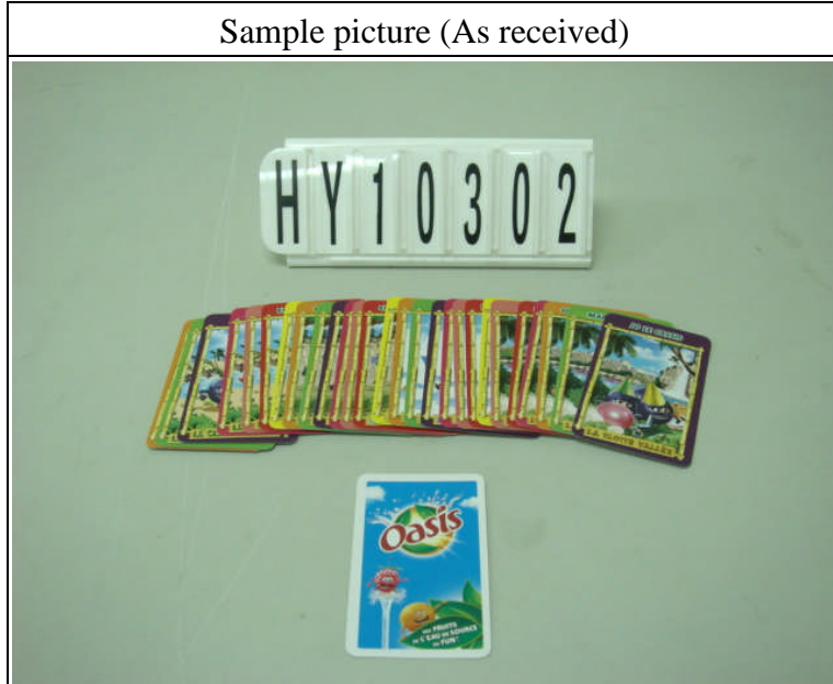
Sample picture (As received)